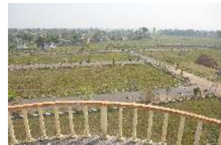
Sai Ganesh nagar @ kankipadu, NH-5, Vijayawada