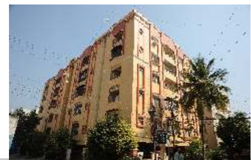
Yashoda paradise @ Rajiv nagar, Hyderabad