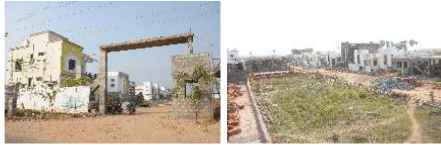
Sai Srinivasa nagar @ Near Hitech city and airport, NH-5, Vijayawada