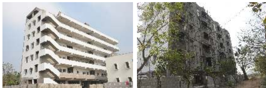
Sri Krishna towers @ Penamaluru, NH-5, Vijayawada