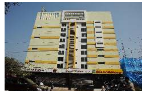
Sri Krishna Residency @ S R nagar, Hyderabad