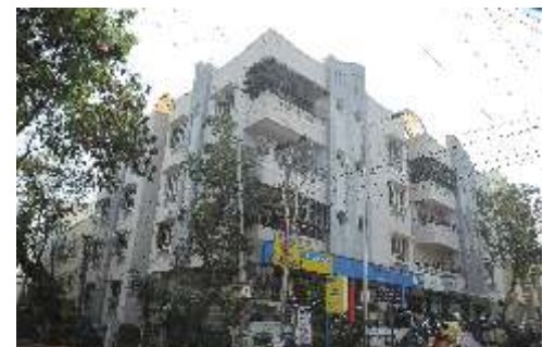
Yashoda classic @ Rajiv nagar, Hyderabad