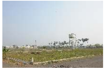
Sai Srinivasa nagar phase 1 & 2 @ Near Hitech city and airport, NH-5, Vijayawada