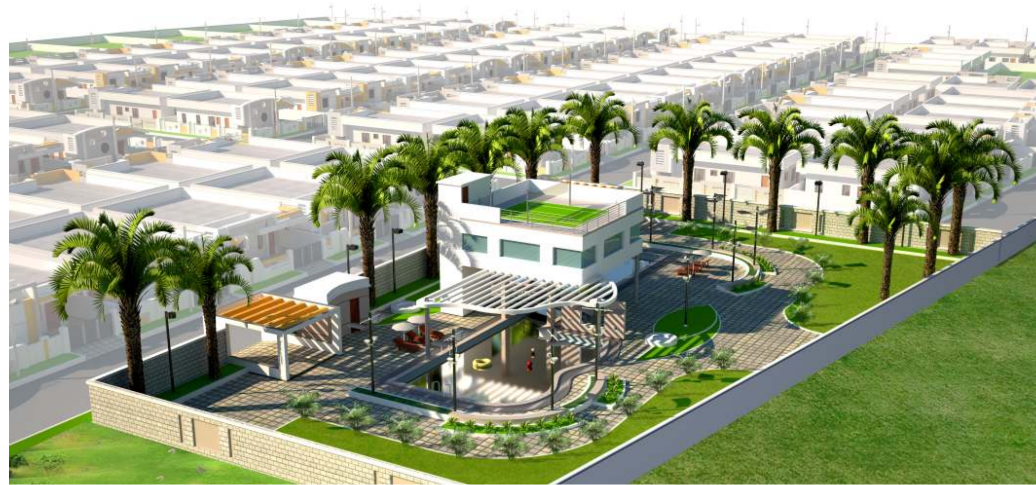
Club House - Swimming pool