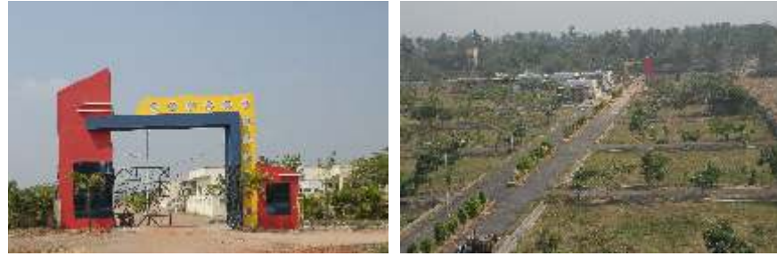
Sai Satyadev nagar @ Neppali, NH-9, Vijayawada